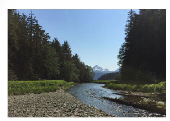
Hilda Creek conservation property on a bluebird summer day.

Hilda Creek is open to the public and is a popular stop-over for kayakers. It is only accessible by boat, plane, or foot, and is surrounded by undeveloped, pure wilderness!