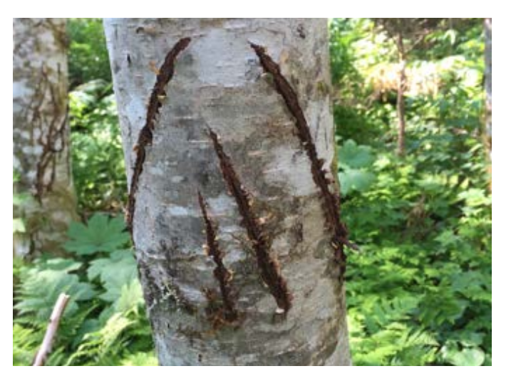
Bear scratches on a tree at the Hilda Creek conservation property.